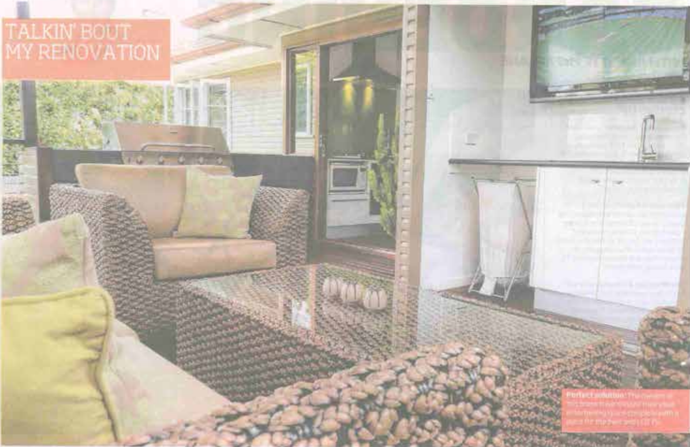
Perfect solution! The owners of this space have made their great entertaining space complete with a space for the TV and BBQ.