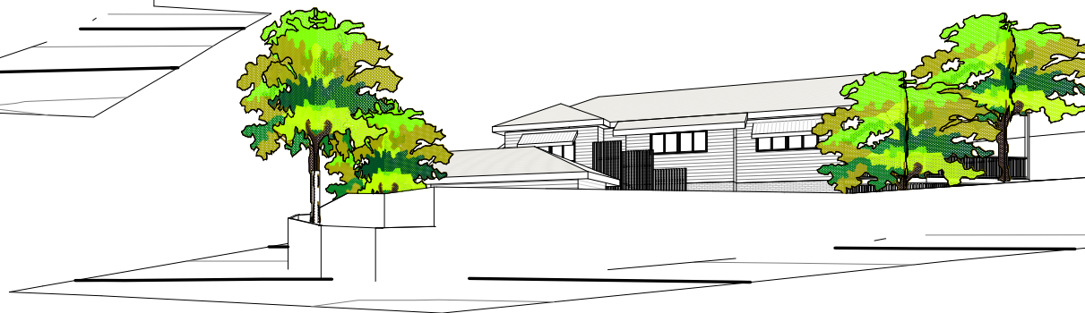
3 VIEW FROM 2ND STREET