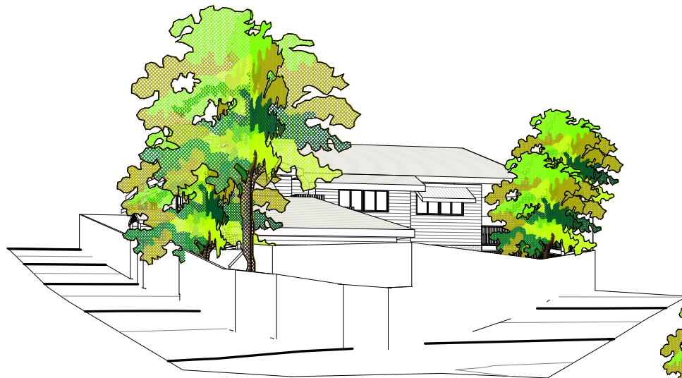
1 VIEW FROM CORNER