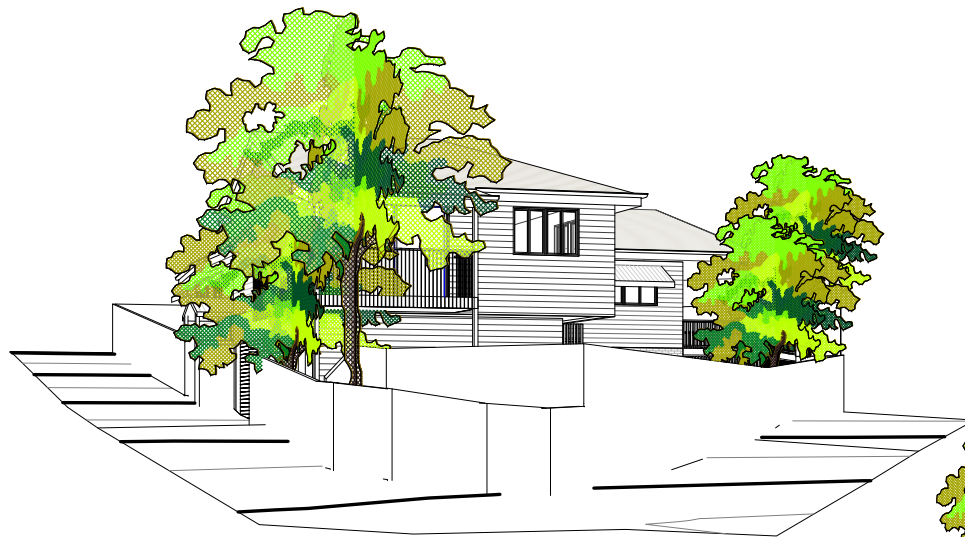
1 VIEW FROM CORNER