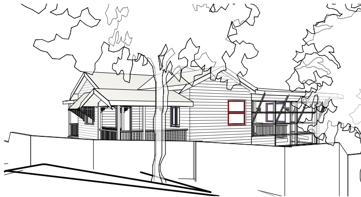
② STREET CORNER VIEW