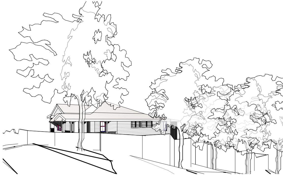
3 STREET CORNER VIEW