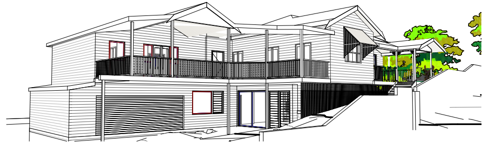
③ SOUTH VIEW